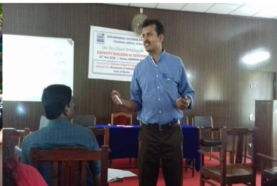
CAPACITY BUILDING FOR TEACHERS

Executed the organization of National seminars, workshops, lecture series, quizzes, debates etc. by different departments and clubs at the institution