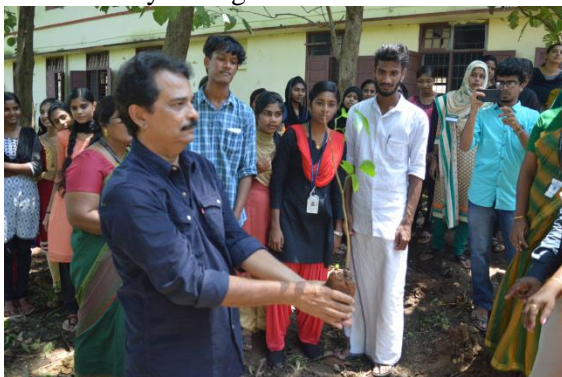
BIRDS CLUB INAUGURATION

Decided to monitor curricular dissemination through Lecture series, Invited lectures, international / National Seminars, Workshops, Quiz, Debates, Group discussions, Exhibition and Celebration of National Days of significance.