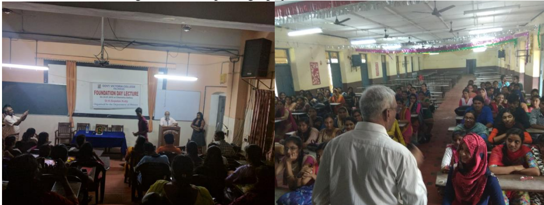
Foundation day celebrations- 2019

Ozone day Celebration: Conducted awareness programme to students on ozone depletion and global warming by Environment Club and Department of Botany. Nature club of our college observed World Environment Day 5th June, World population Day 11th July. World Ozone Day 16th September and Conducted class on the topic Need and importance of Energy Conservation on 17/09/2016. On October 1st the club conduct a wildlife photo graphic exhibition in association with LEEP an NGO working in wild life photography.