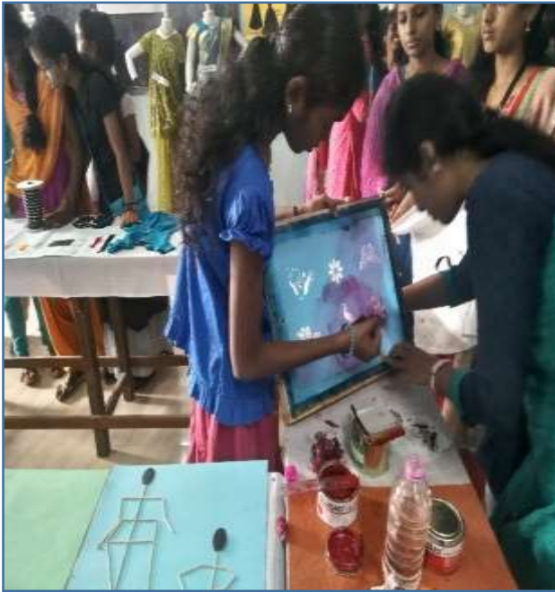
Fabric Screen Printing @ 5/- Rs