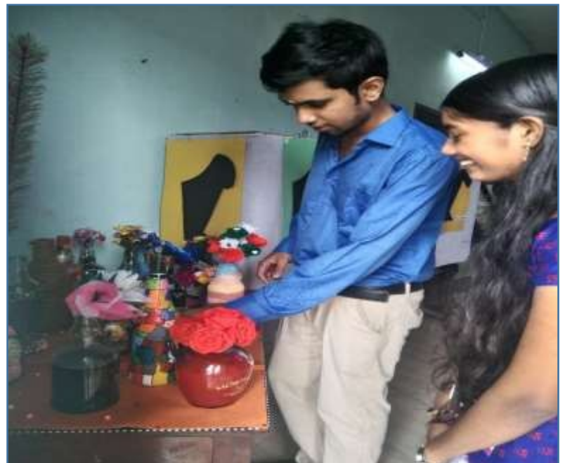
Old wine in new battle!!!